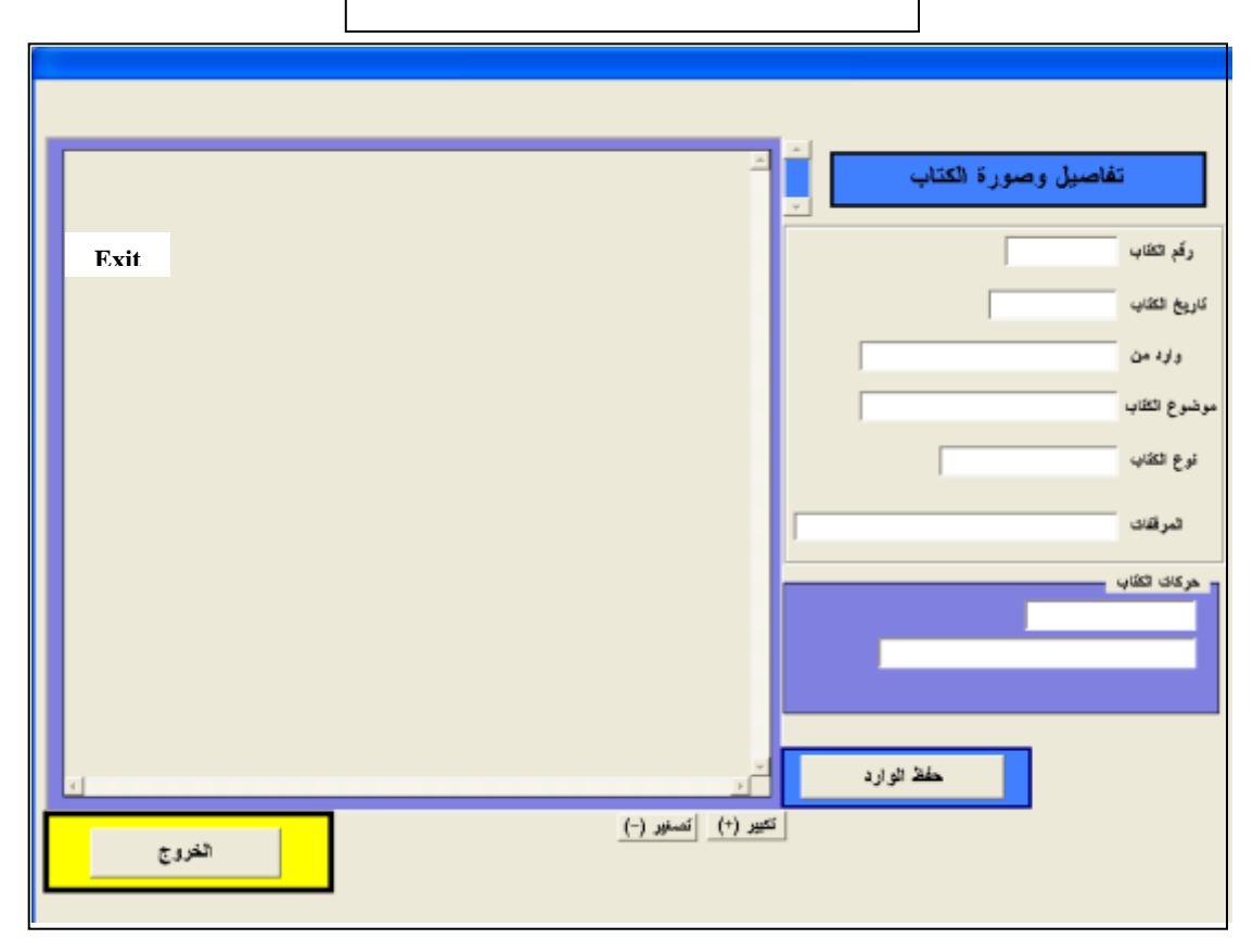
Fig 9: Details screen and the image book incoming