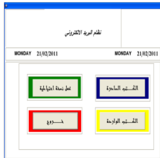
Fig 2: The login screen to the program