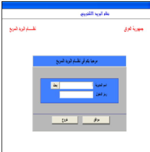
Fig 1: Main display screen